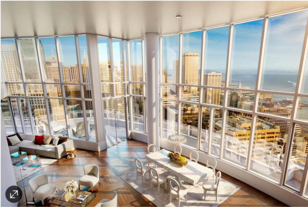
A rendering of the under-construction, 15,000-square-foot penthouse at the Lumina. ILLUSTRATION: STEELBLUE/TISHMAN SPEYER

The roughly 15,000-square-foot unit is in the Lumina, a two-tower project that is generating sales from the booming tech industry